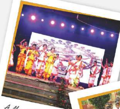
A Moment from Gathering