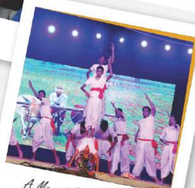
A Moment from Gathering