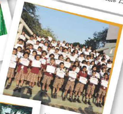
Winners of Navreet