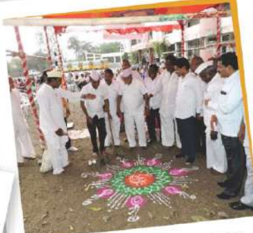
Bhumi Pujan of New Building of School