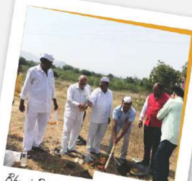
Bhumi Pujan of Jejuri Branch