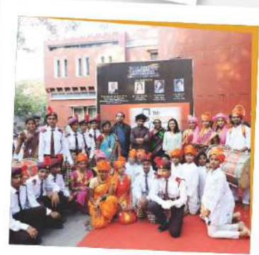
At FTI Welcoming Guest